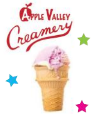
FREE SCOOP OF ICE CREAM AT APPLE VALLEY CREAMERY