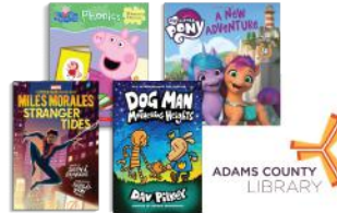
FREE BOOK FROM THE EAST BERLIN LIBRARY