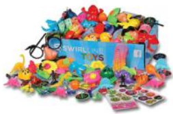
PICK FROM PRIZE BOX

(LISTED BY NUMBER OF CHALLENGES COMPLETED)