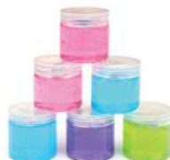
CANISTER OF SLIME